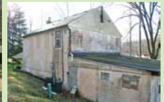
Original Girls Dorm built in 1950, remodeled into Manager's House in 1981.