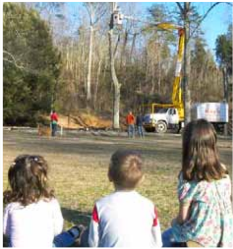
The Yankey children watch site preparation for their new house.