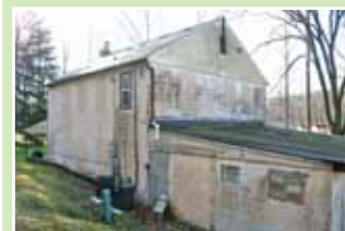
Original Girls Dorm built in 1950, remodeled into Manager's House in 1981.