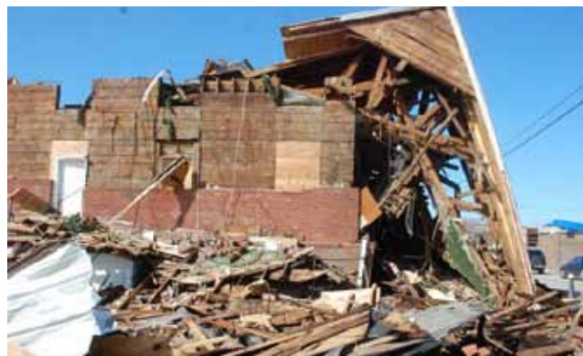
Remains of the 100 year old West Liberty Christian Church building

It will be years before the town of West Liberty is back to normal, but the members of West Liberty Christian Church remain committed to serving the area, even without a physical building to call their own. A local Christian Community church has partnered with WLCC to allow them to share their facility until they have a new building.