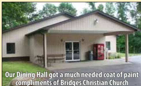
Our Dining Hall got a much needed coat of paint compliments of Bridges Christian Church