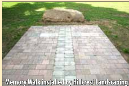
Memory Walk installed by Hillcrest Landscaping