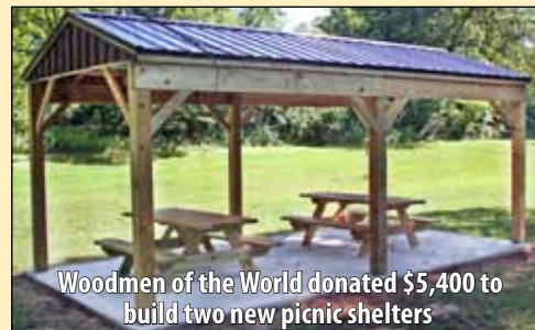
Woodmen of the World donated $5,400 to build two new picnic shelters